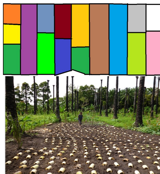
Figure 2: replant section

As replant sections become more important for food production, social and kinship networks are becoming critical for assisting smallholders to access additional land for food production. It is now common for a block-owner to allocate plots of land within his/her 2 ha replant section to people residing on other leasehold blocks. Most often these people are relatives, friends and neighbours living on other blocks where land is short and there is no replant section available for gardening.