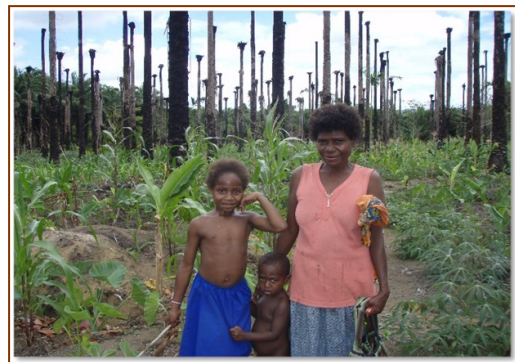
Plate 1: Smallholder replant section

4. Legumes such as peanuts have been incorporated into crop rotations.